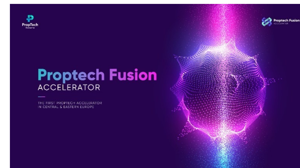
Fusion - the first PROPTech CORPORATE & STARTUPS ACCELERATOR IN CEE