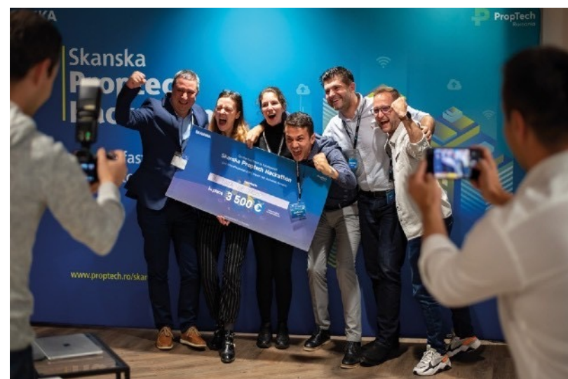
Skanska Proptech Hackathon