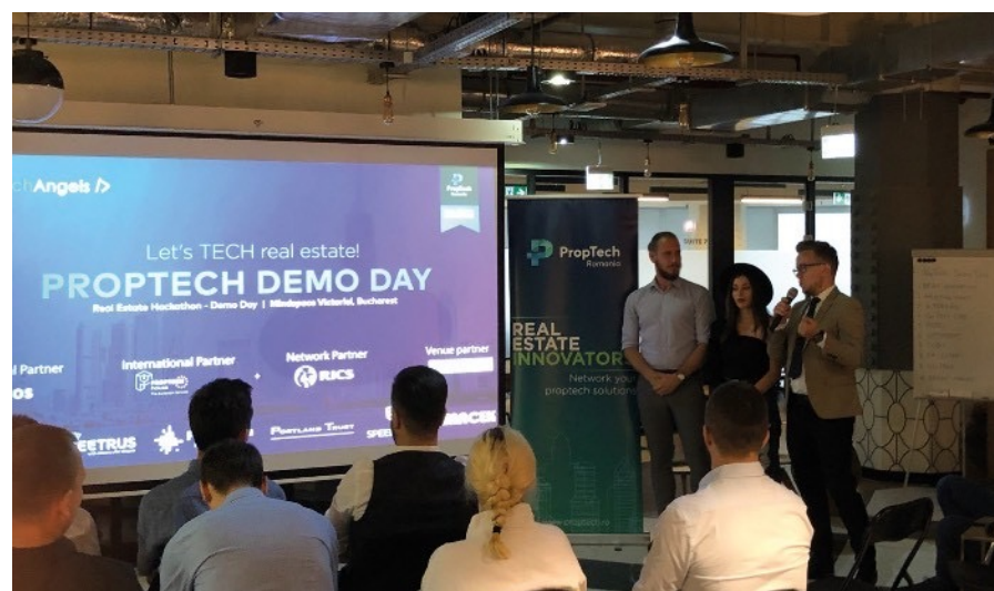
Real Estate Hackathon + Demo Day

Events, partnerships, startups investments, incubation, acceleration